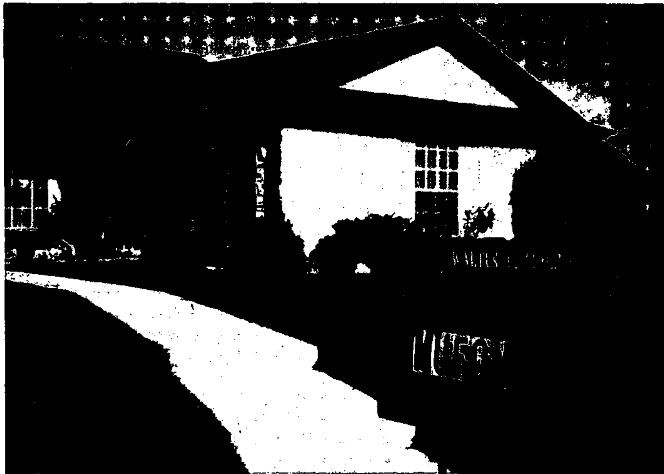
MUFON ADMINISTRATIVE OFFICES